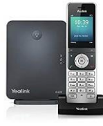
Yealink DECT Cordless