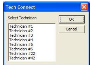
Tech Connect provides one touch, on line access to DuVoice

The optional Software Support Agreement insures that your DuVoice system is always at the latest software version. All DuVoice systems are covered by a one year warranty. Extended Warranty keeps your hardware covered beyond the initial warranty period.